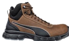
CONDOR BROWN MID 630122