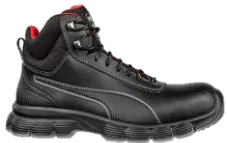
CONDOR BLACK MID 630101